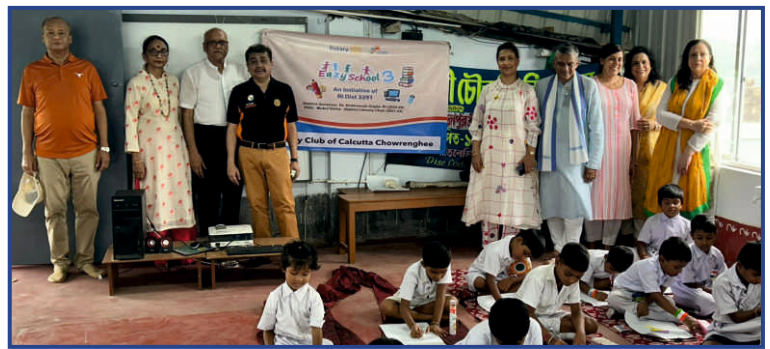
Easy School 3 Launch at Rcv Uluberia 15 th August.