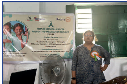
Cervical Cancer Workshop At Amoragori

CERVICAL CANCER AWARENESS CAMP 21st August at Amoragori at Chinrajole Narayani Balika Vidyalaya in association with RC Belur and Young Indians. The camp was addressed to the parents of the girls to dispel any myths surrounding taking the vaccination.