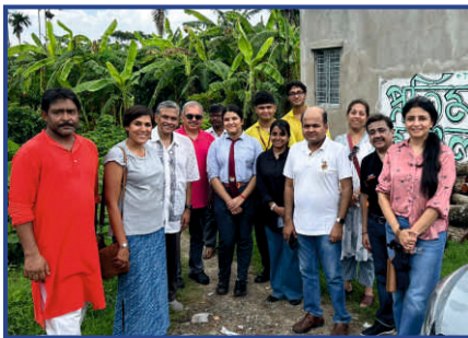
Tree Plantation Joynagar