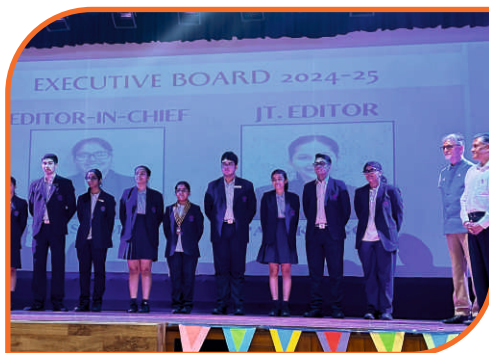
Sri Sri Academy Interactors Take Oath