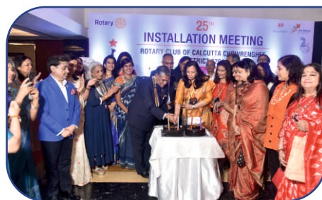
Silver Jubilee Cake Cutting Ceremony