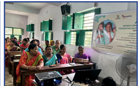
Cervical Cancer Workshop Attendees