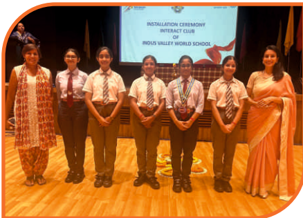
Indus Valley Interact