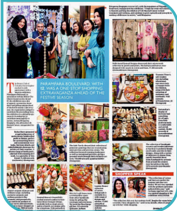
Parampara Boulevard in The News