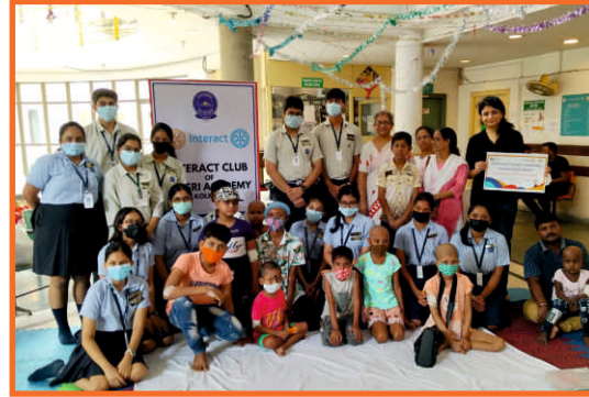
Sri Sri Academy Interactors for Life Beyond Cancer