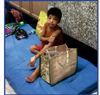
Life Beyond Cancer Child