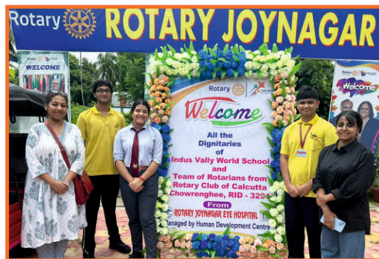
Joynagar Tree Plantation with Indus Valley Interactors