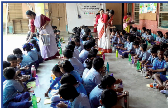
Mid Day Meal at Rotary Chowreghee Vidyalaya