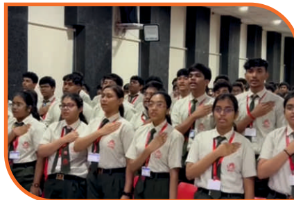
BDMI Oath Taking Ceremony