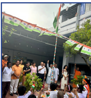
Flag Hoisting at RCV