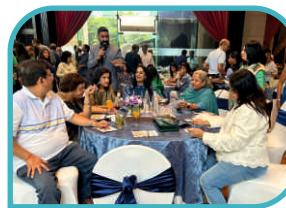
Songbola at Monsoon Fellowship