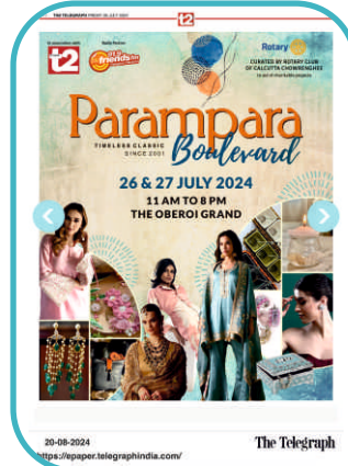
Parampara Telegraph Ad