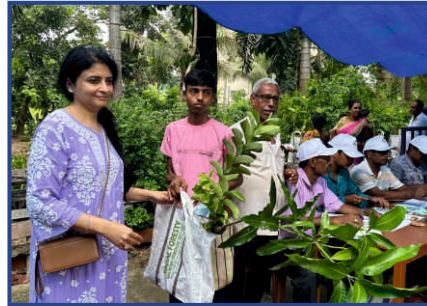
Amorigori Tree Plantation