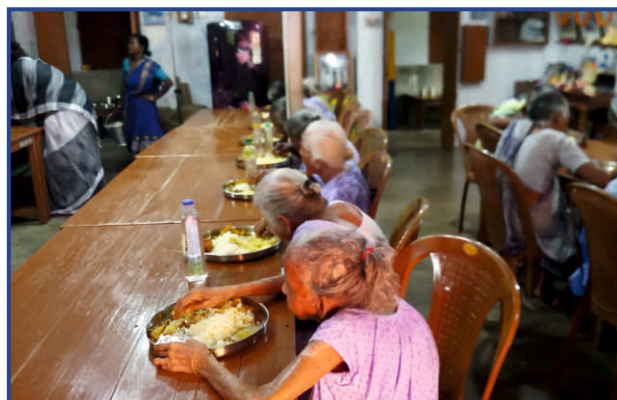
Annapurna Yojana Amorigori