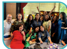
Monsoon Fellowship Brunch