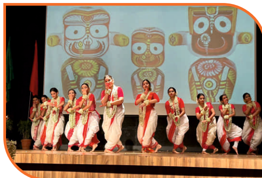
Indus Valley Interact Club Dance