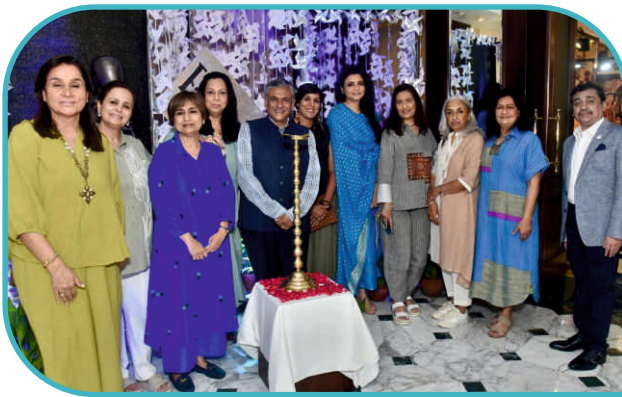
Parampara Team with Other Club Members