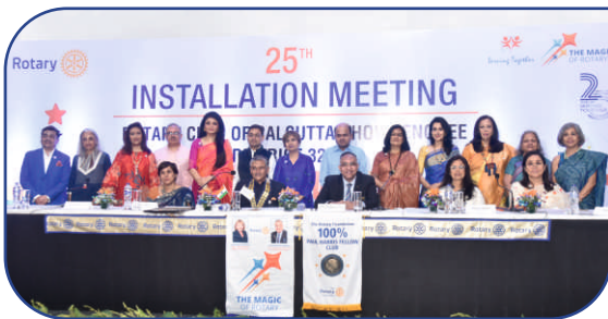
Board of 2024-25