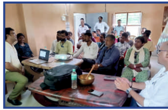
Mental Health Camp at Amorigori

MENTAL HEALTH CAMP was organised at Amorigori through the RCC on 30th July. 42 people attended and the same was very well received.