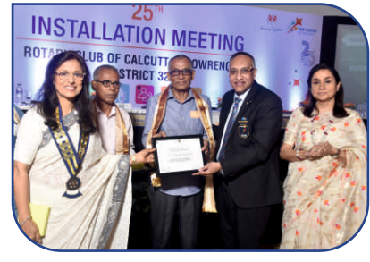
Appreciation Certificate to Amoragori Rcc Team