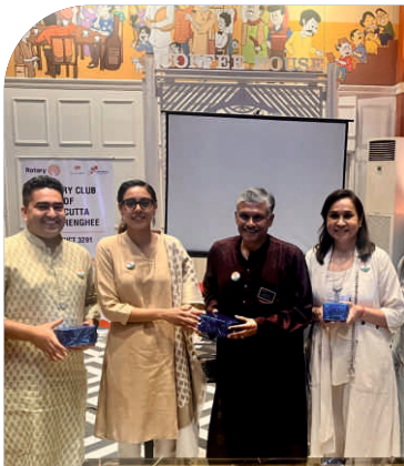
Freedom Quiz Winners