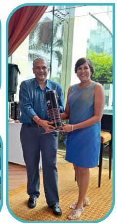
Songbola Prize Moment