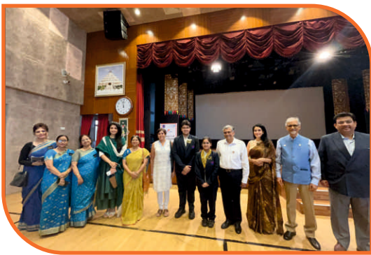
Sri Sri Academy Installation