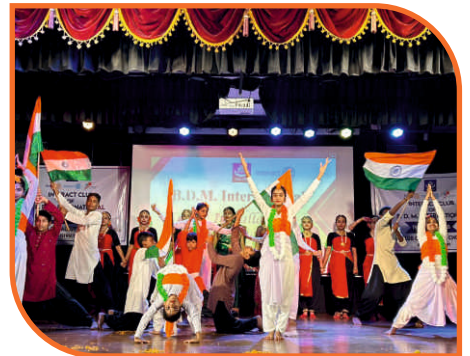
BDMI Dance with NGO and Interact Kids