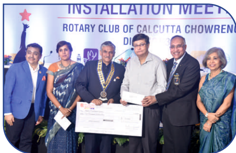
The Rotary Foundation cheque