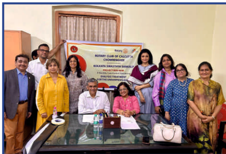
Project REN-EW KSS