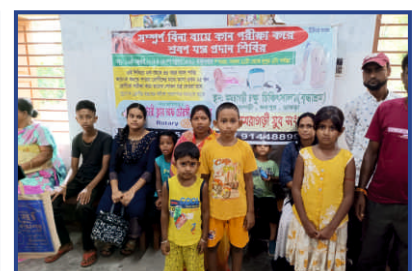
Children At Screening Camp