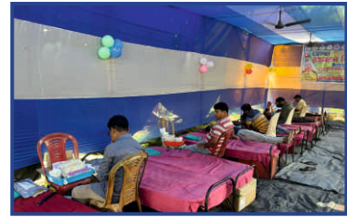
Blood Donation Camp at Joynagar on 14th July