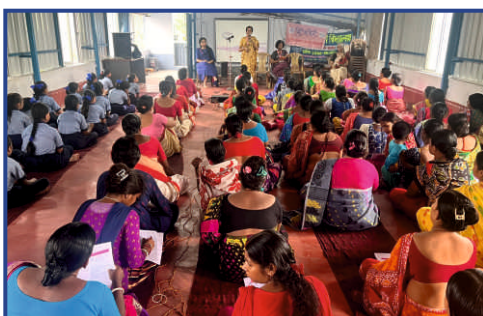
Breast Cancer Awareness At Uluberia