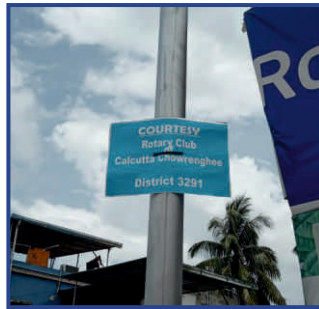
Solar Lights At Joynagar

TREE PLANTATION AND SOLAR LIGHTS were installed at Joynagar(14th July), Amorigori (31st July) and Amtalla(12th August).