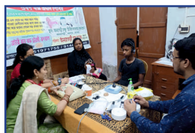
Hearing Aid Screening Camp

THE HEARING AID SCREENING CAMP was conducted by Amplifon India at Amoragori on 13th August. The hearing loss detection and measurements were taken of potential beneficiaries. Distribution of 25 hearing aids will be done in ten days time.