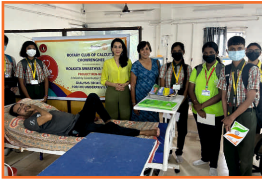
Interactors from BDMI at KSS

All three schools have graciously involved their students in many social service projects. Interactors from Sri Sri Academy joined us for the Life Beyond Cancer project at the Saroj Gupta cancer center and research institute at Thakurpukur. The Indus Valley Interactors joined our members in Joynagar for a tree plantation activity. The BDMI interactors came for a site visit to Kolkata Swasthya Sankalp Dialysis Centre and met the patients personally while also understanding the functionality of the equipment.